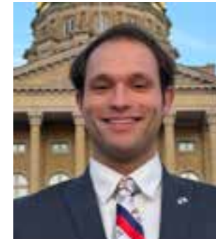
Grant Hill Candidate for the House of Representatives in Iowa